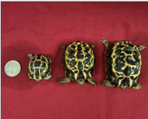
Left to right: 5days, 1 year, 2 years

A Pyxis arachnoides brygooi hatched on 22 March 2009, the third in two years. This subspecies was recently confirmed as the most threatened of the three spider tortoises, and has been heavily impacted by conversion of habitat for agriculture and over collection. Few viable wild populations remain making brygooi a high priority for coordinated captive management.