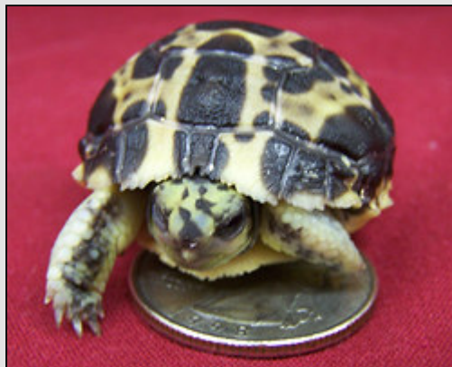
5 day old hatchling

UNSUBSCRIBE NOTICE: If you wish to discontinue receiving from Turtle Survival Alliance, click here to unsubscribe