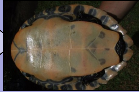
Suwannee Cooter ( Pseudemys concinna suwanniensis )