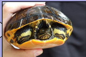
Florida Chicken Turtle ( Deirochelys reticularia chrysea )