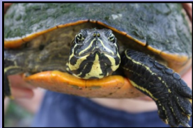
Florida Redbelly Cooter ( Pseudemys nelsoni )