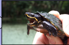
Common Musk Turtle or Stinkpot ( Sternotherus odoratus )