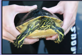
Florida Peninsula Cooter ( Pseudemys peninsularis )