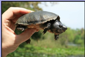
Loggerhead Musk Turtle ( Sternotherus minor minor )