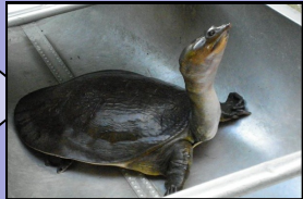
Florida Softshell Turtle ( Apalone ferox )