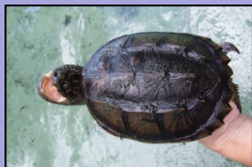
Florida Snapping Turtle ( Chelydra serpentina osceola )